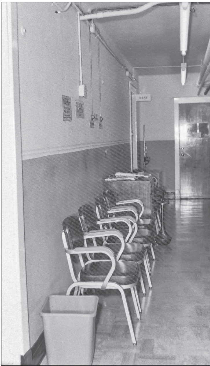
A WAITING AREA inside Jarman Hospital.