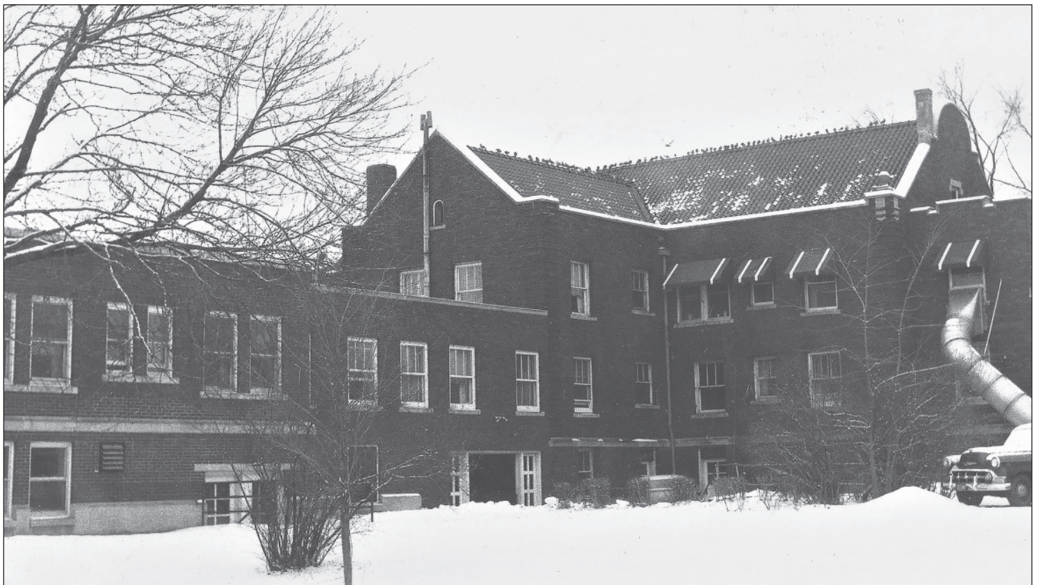
A REAR VIEW of the old Jarman Hospital.