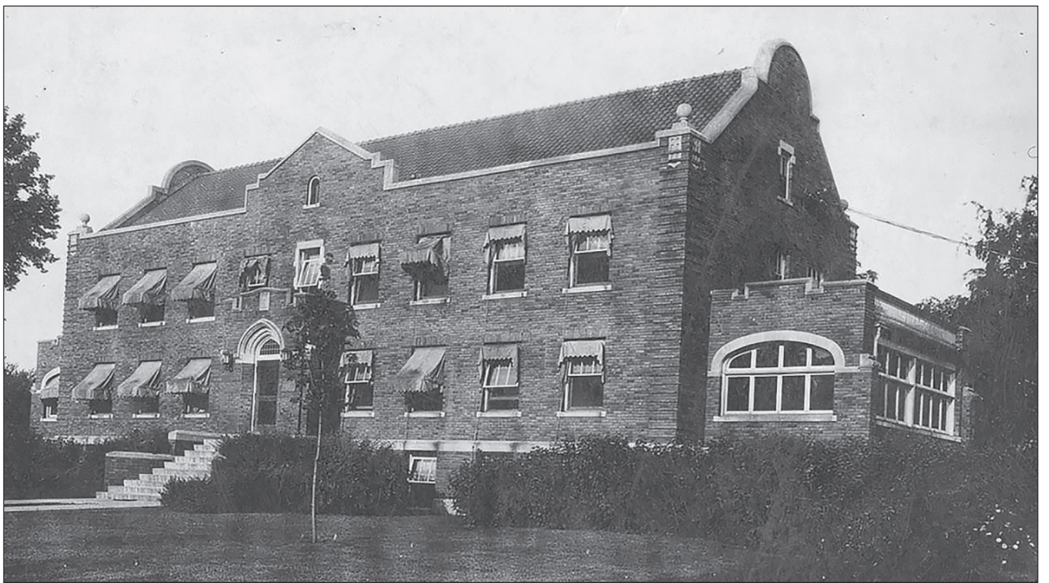
THE ORIGINAL JARMAN Hospital on North Main Street in Tuscola.