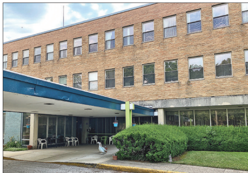
JARMAN HOSPITAL as it looked a year ago.