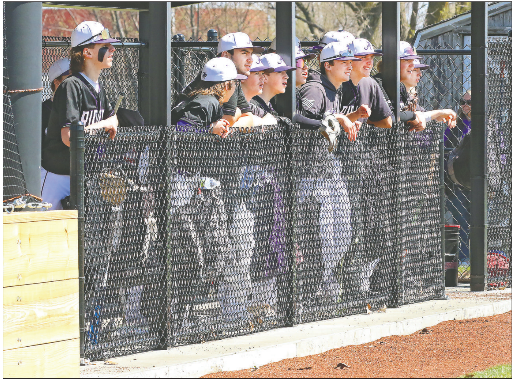
THE ARCOLA BASEBALL TEAM is getting settled into the new dugout facilities while watching Martinsville warm up before the first official home game of the season. The totally new dugout areas are just part of the renovations to the baseball field at Moore Park. The city of Arcola continues to work on the baseball, softball and t-ball diamonds in addition to several other improvements being made at the park. Arcola won the home opener against Martinsville 21-2 on Saturday, April 8.

The show will be open 10 a.m. to 4 p.m. Thursday and Friday and 10 a.m. to 3 p.m. on Saturday. There is a small admission fee.