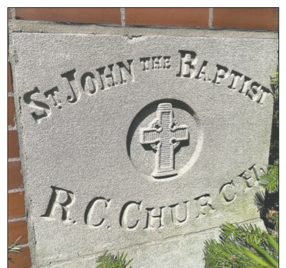
THE ST. JOHN THE BAPTIST Catholic Church cornerstone was laid in mid-1902, the work on the church was finished in 1903.

St. John the Baptist Catholic Church as it looks today. See story on page 4.