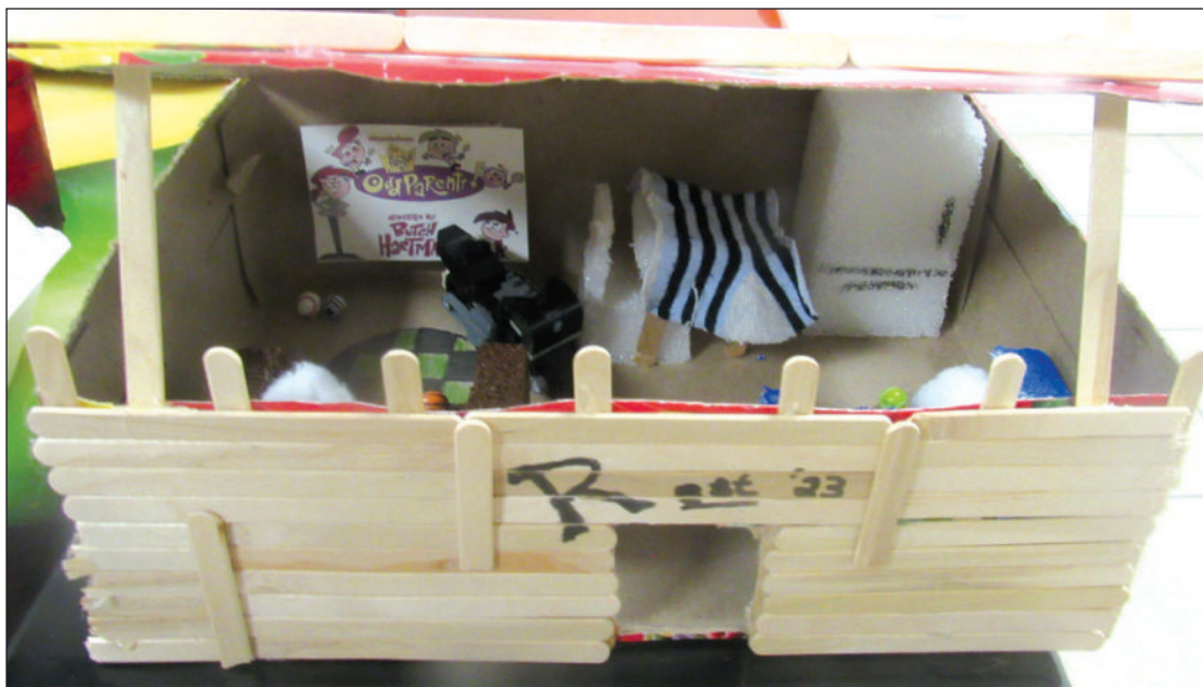
A 'mouse house' designed by one of the students.