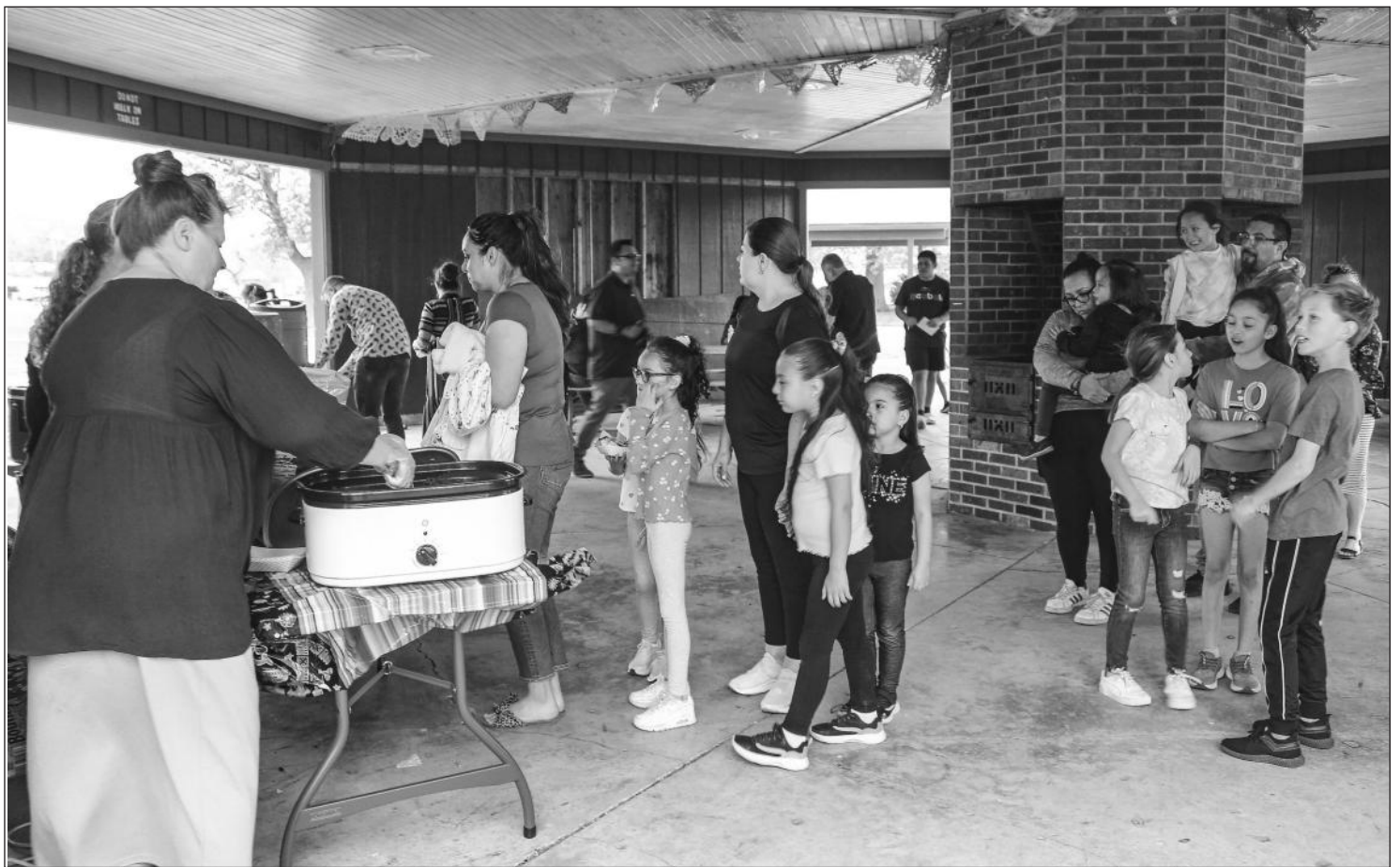
MOORE PARK WAS BUZZING with activity May 5 for the annual Cinco de Mayo celebration. Residents lined up for food but the area outside of the pavilion was full of kids taking full advantage of the park's playgrounds and playing fields. The new splash pad is nearly complete and expected to be operational this summer.