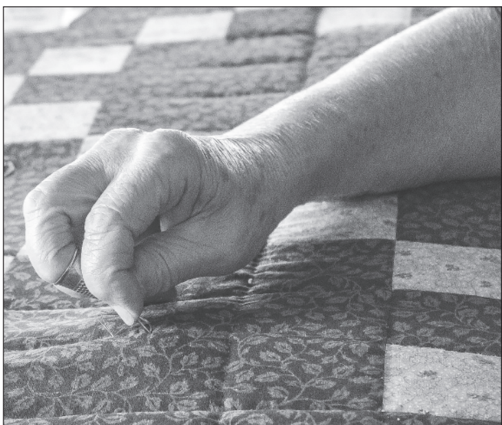
An Amish woman demonstrates the time-consuming task of hand quilting Saturday at the Illinois Amish Heritage Center.

Memorial donations may be made to: Baptist Children's Home and Family Services, 949 County Rd. 1300 N Carmi, IL 62821. Online condolence may be shared via hilligossshraderfh.com.