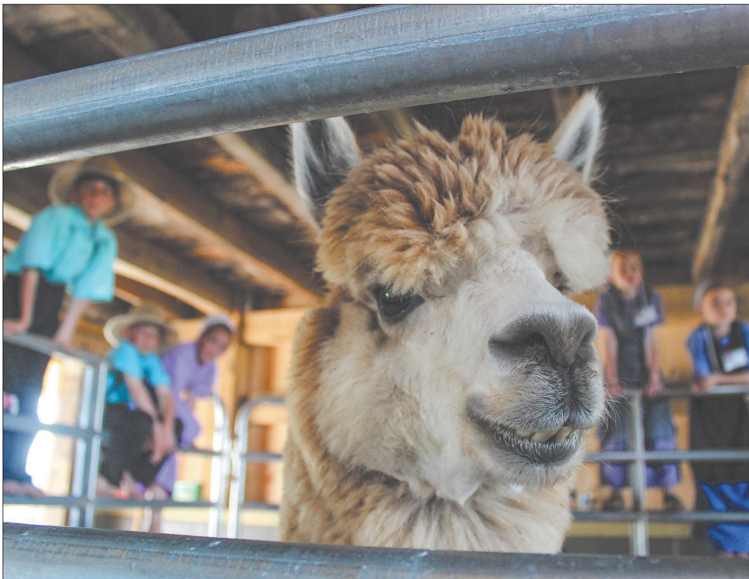
THE CHILDREN WATCHING an alpaca being sheared were not the only ones interested in the action Saturday at the Illinois Amish Heritage Center. Another alpaca doesn't seem to mind being next in line for a haircut.