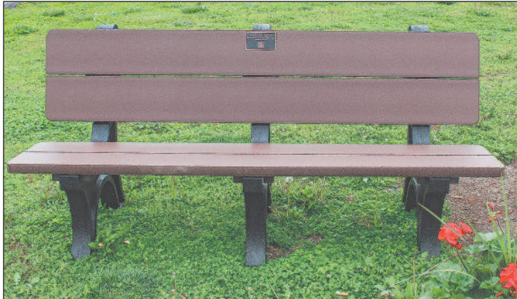
ONE OF THE BENCHES at the Discovery Garden at the Illinois Amish Heritage Center.