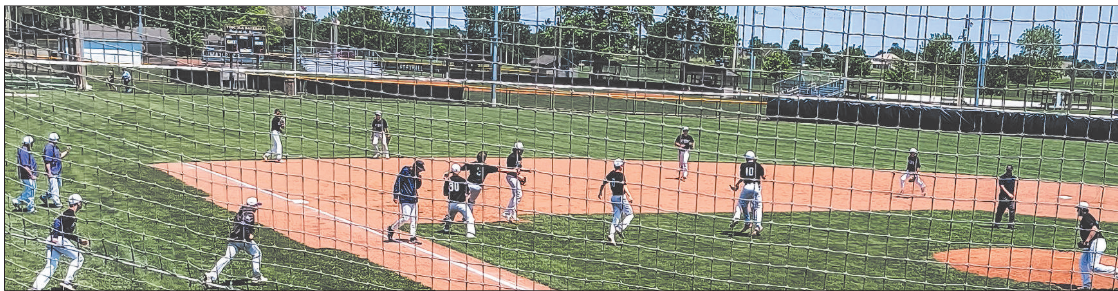
THE CELEBRATION IS ON as Arcola won the Tuscola Class 1A regional championship Saturday. The only other time Arcola won a regional was 1984.