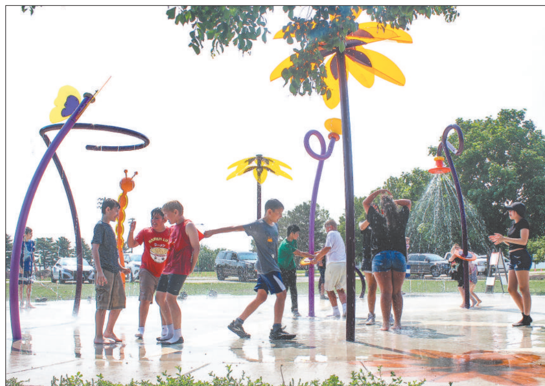
KIDS ENJOYED the new splash pad at Moore Park, but the city closed the feature out of liability concerns after several children fell on the concrete. The city is working with the contractor to improve the grip of the surface.