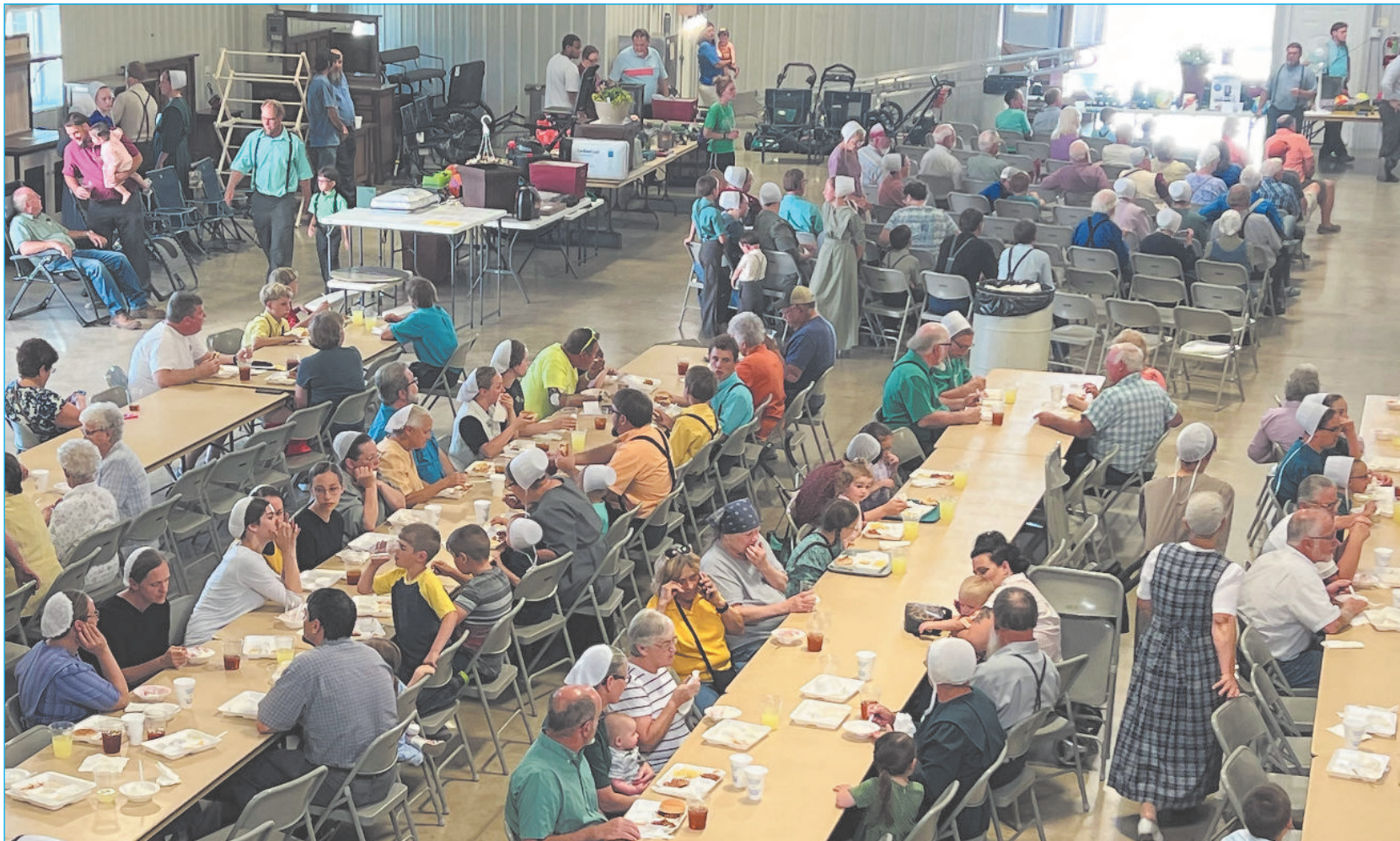
THE STRAWBERRY SOCIAL committee moved their annual event from Saturday to Friday this year at the Otto Center and is held in conjunction with the Strawberry Jam Festival in downtown Arthur. An all-day bake sale took place, shortcake, strawberries, soft serve ice cream, and those famous strawberry pies were served starting at 11 a.m. till closing followed by dinner which began at 4 p.m. and the mini-auction kicked-off shortly after 6 p.m. According to organizers, 630 meals were served and the auction total was not quite finalized as of late Saturday but the overall total amount raised was higher than last year. They also had a stand downtown both days selling whole pies, slices of pies, min-pies, and quarts of fresh strawberries which they completely sold out before noon on Saturday. Proceeds from the Social help defray expenses for the Haiti Benefit Auction to be held October 27-28, 2023 at the Otto Center.