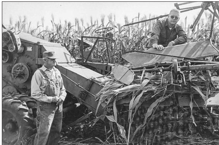
PICTURED ARE two more scenes from Libman Company's broom corn production circa 1958 recently discovered in our Tuscola archives.