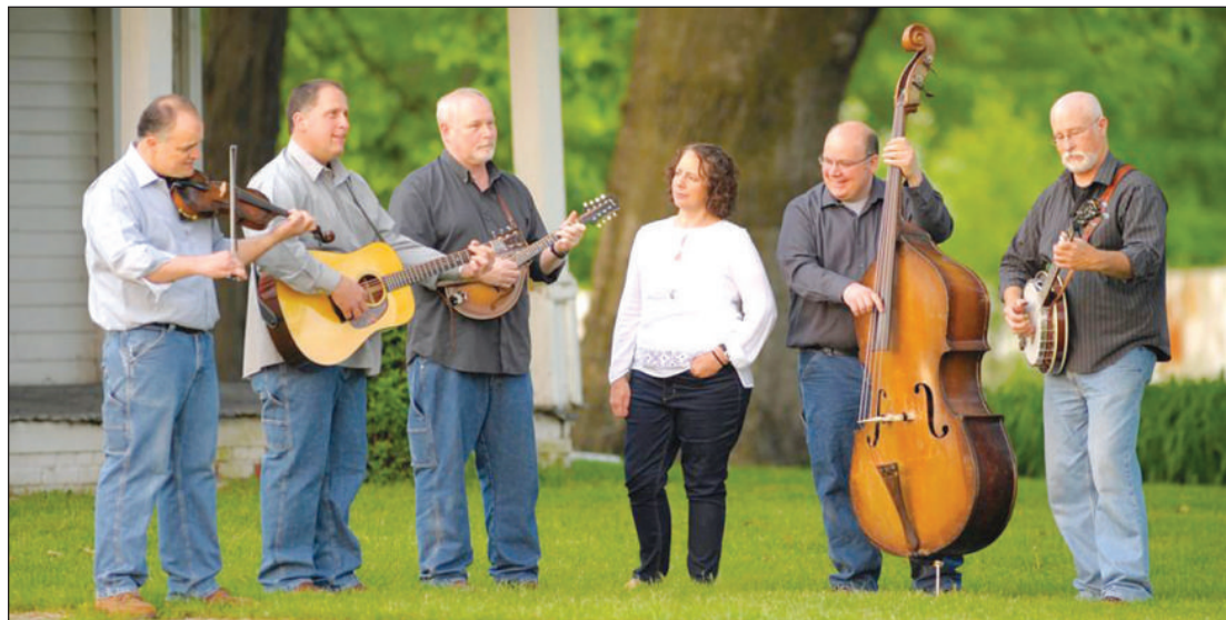
The second in the Summer Concert Series in downtown Atwood will be the popular musical group, Mackville, on Saturday, June 24 from 5-7 p.m.