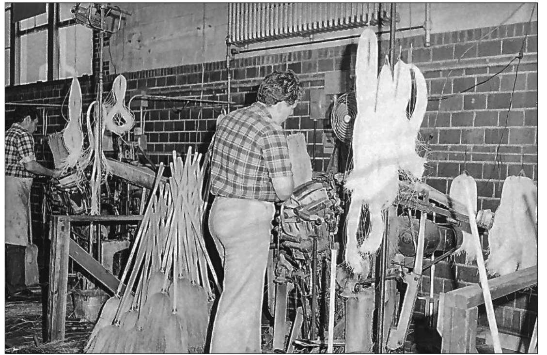
THESE ARE THE LAST of the photos of Libman Company making brooms circa 1958 in the former East Side School building in Arcola recently discovered in our Tuscola archives. The current facility, still on the same site, now has 2 million square feet under roof and has grown to become the largest U.S. manufacture of cleaning supplies.