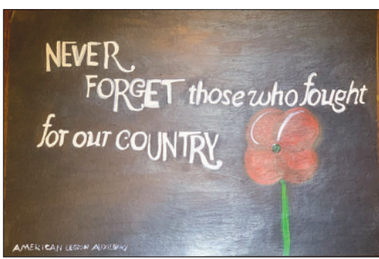
First place: Blanca Briseno- 9th grade