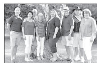
Collage of Faith