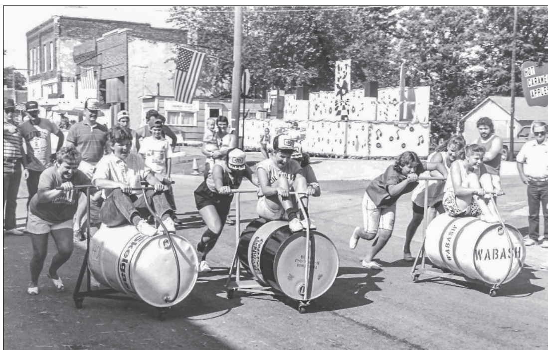
WHAT CAN YOU TELL US about this photo dug out from our archives? Send info to preseditor1@gmail.com .