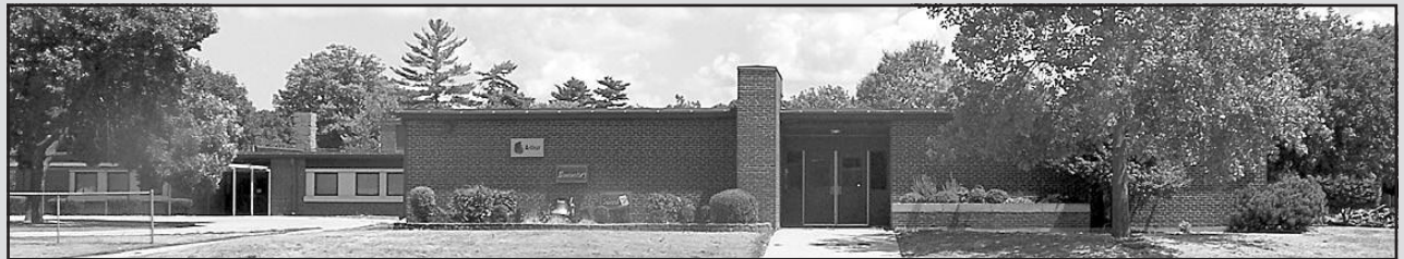
Arthur Grade School