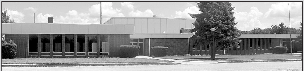
Lovington Grade School