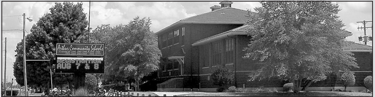
ALAH High School