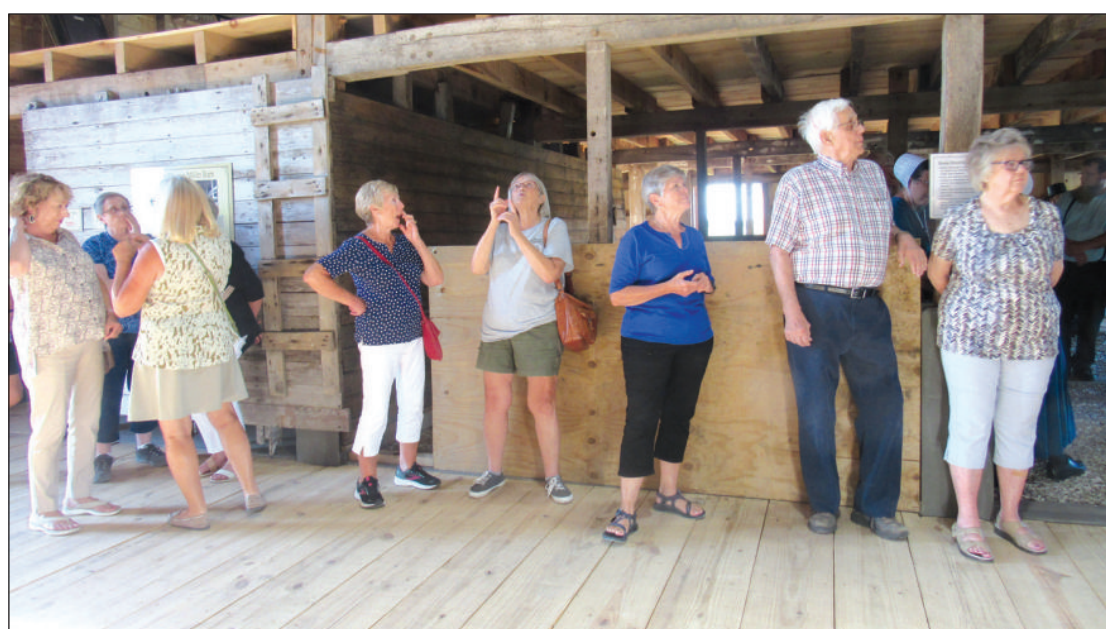
A few of those in attendance at the event.