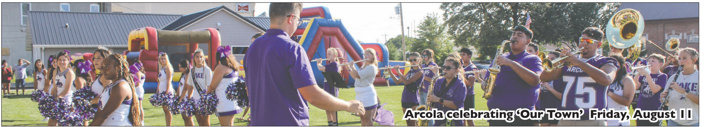
Arcola celebrating 'Our Town' Friday, August 11