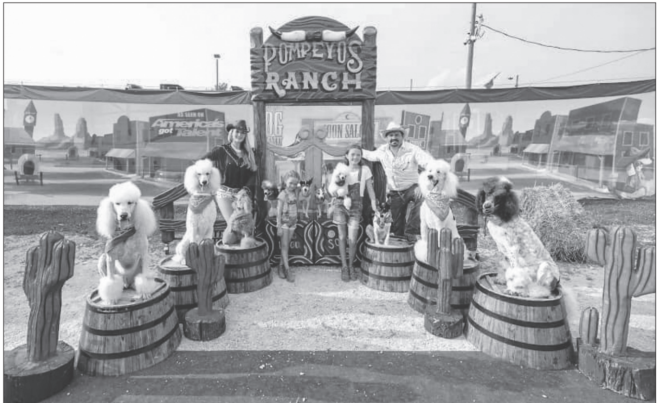
The Pompeo Family with some of their dogs