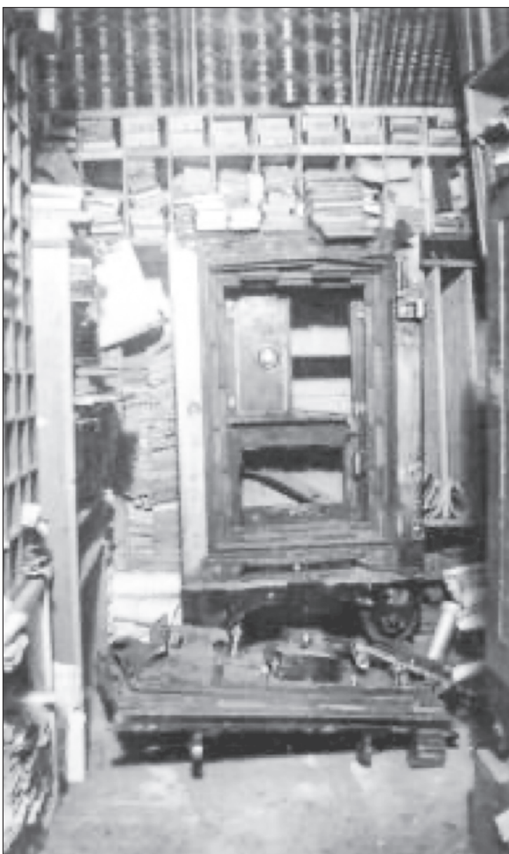
THE "BURGLAR-PROOF" SAFE after its doors were blown off by nitroglycerin.

The editor of the Arthur Graphic put it this way, "Our city will be familiarly spoken of in the annals of crime yet to be written and we will rank along with Coffeyville, Kansas and other western towns where outlaws have reigned supreme..."