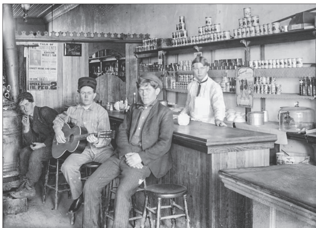
EARLY RESTAURANT owned by George O. McClure called the East Side Restaurant circa 1902.