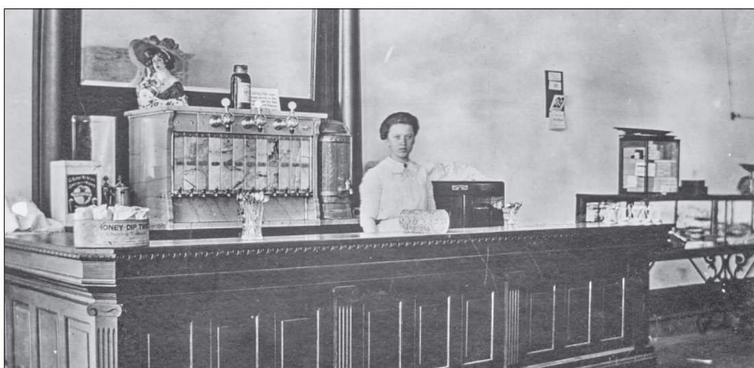
THE ALEXANDER ZAN GONY Bakery and Confectionery located at the northwest corner of Vine and Progress streets, 1910, reportedly made some of the finest baked goods around.