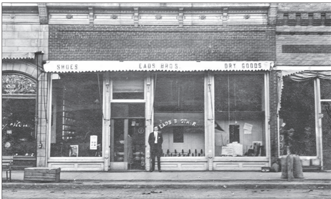
IN 1906 THE EADS BROTHERS purchased the business at 136 S. Vine Street and established a general store that sold a combination of shoes, groceries and men's work clothing. After a major renovation in 1940, the name became Eads Store. After operating for 74 years by members of the Ead's family, the store closed on January 19, 1980.