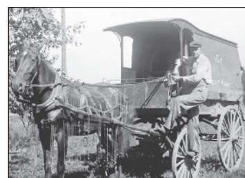
Stock Brothers ice wagon

A trip to the hardware store: Chairs $1.25 each, Cookstove $25, Lantern $1, breach-load-