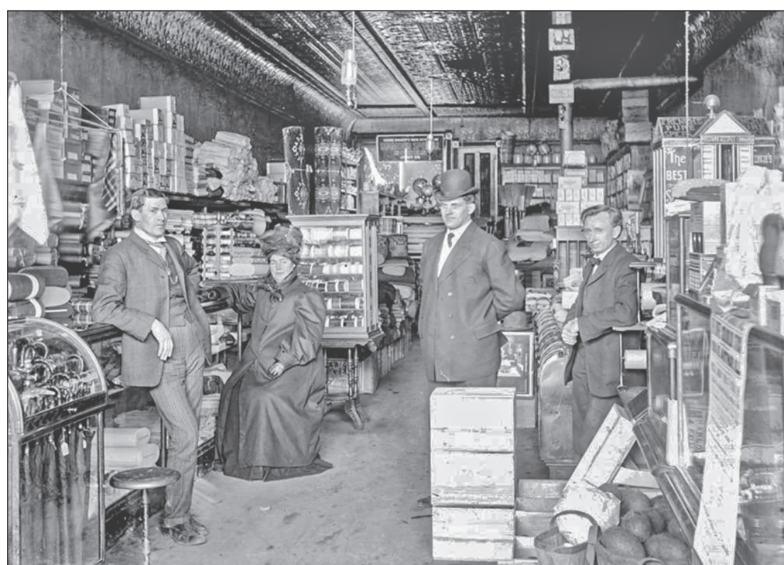
INTERIOR VIEW of the Rigby General Store, 118-120 S. Vine St.

A postage stamp for a half-ounce letter was three cents (Washington). The three-cent silver and nickel coins were useful in purchasing stamps. The $3 gold coin would buy a sheet of 100 stamps.