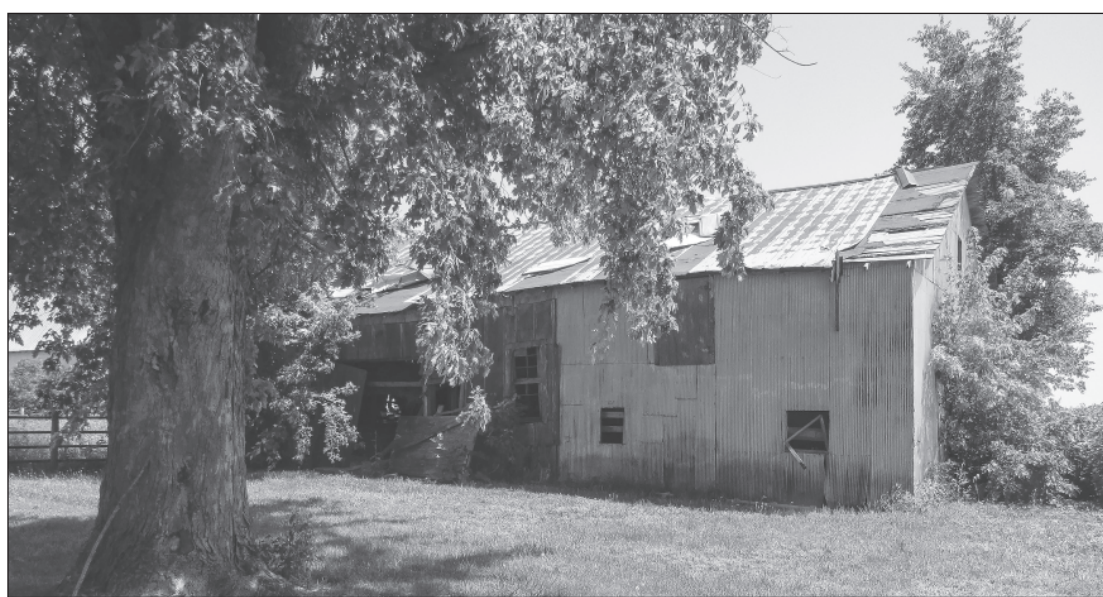
THE MARNER CHEESE FACTORY as it looks today. Located just north of Beachy's Bulk Foods on the old Marner homeplace.