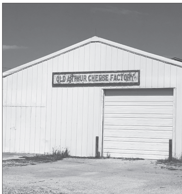
THE OLD Arthur Cheese factory.