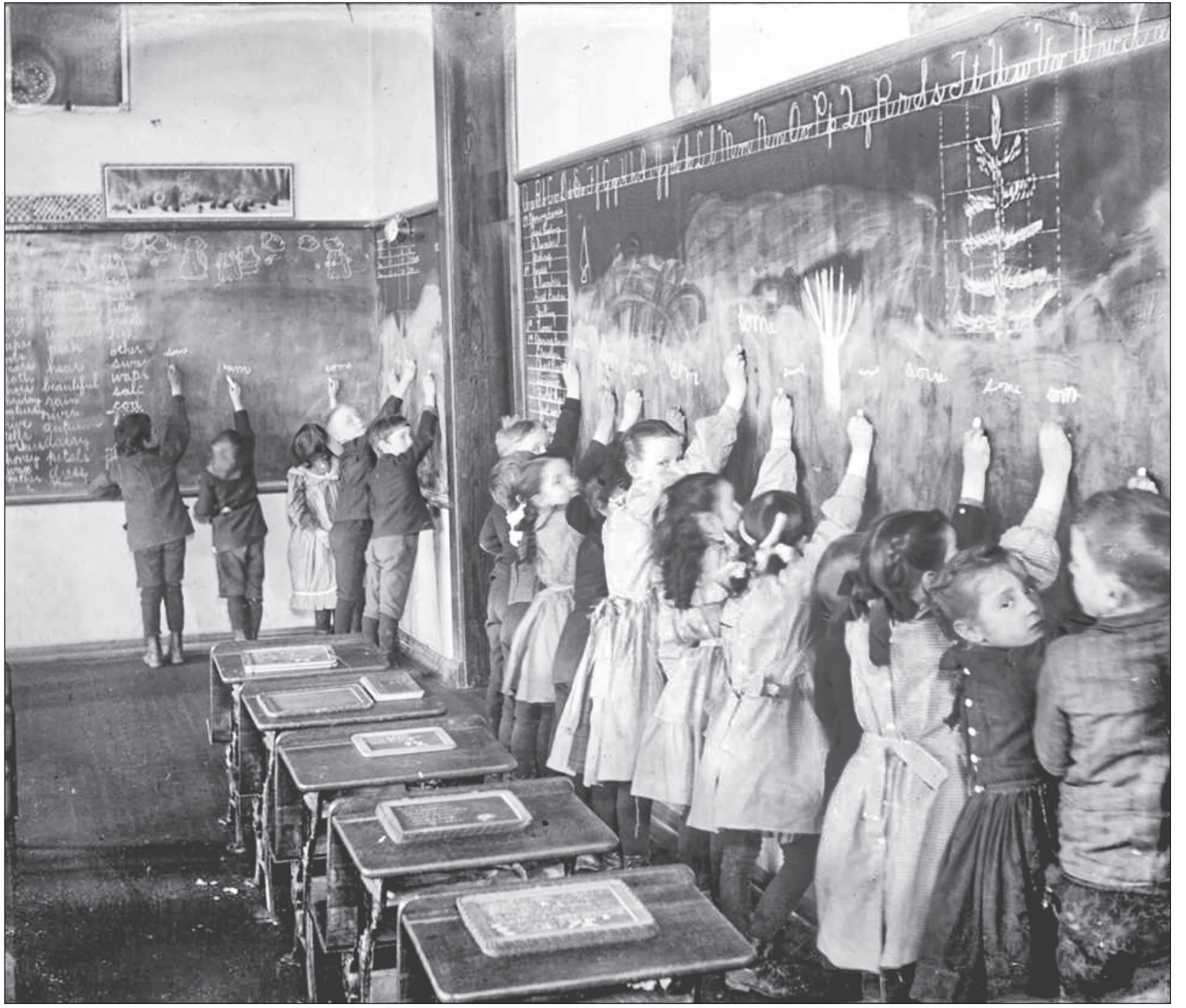
GRADE SCHOOL CLASSROOM with students writing on blackboard circa 1905.

In 1960, the original grade school was torn down and replaced with a more modern facility. A large addition to the high school was also completed in 1960 to include science