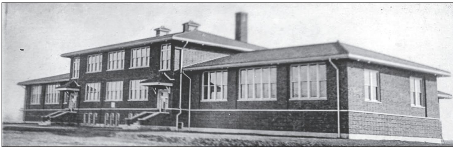
THE COMPLETED HIGH SCHOOL in 1917. The first classes held in the new building were in the fall of that year. In 1937, a new gymnasium was added.