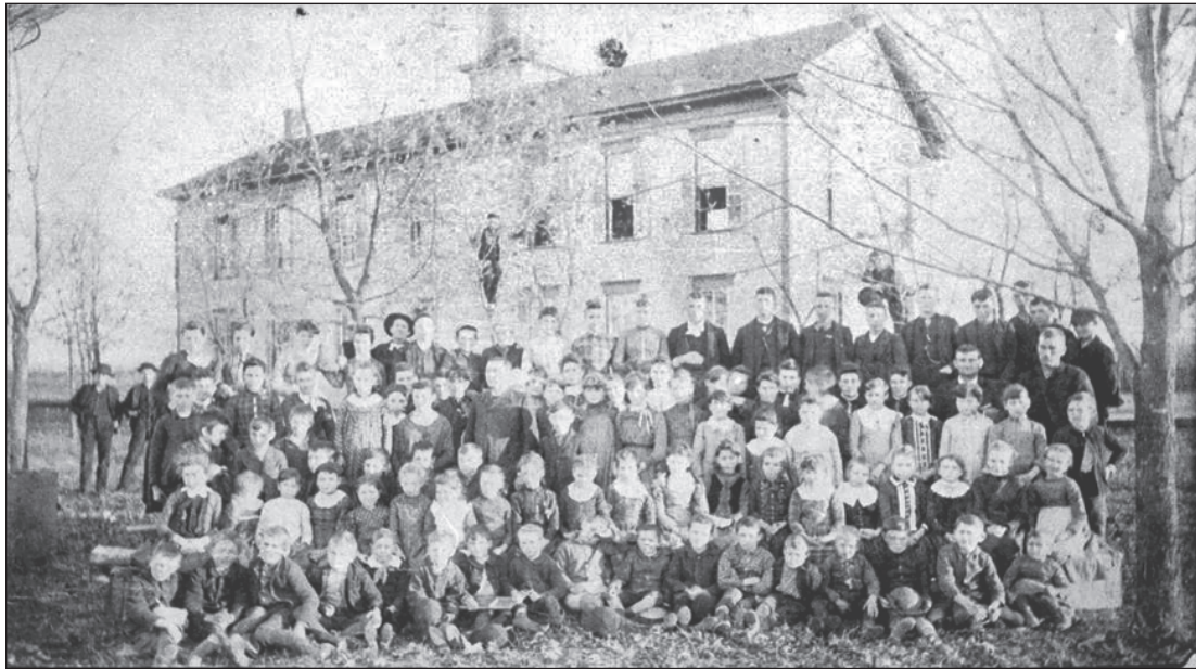
STUDENTS STANDING in front of Arthur's first public school.

the year of Arthur's founding in 1873, schools remain an important part in the life of this community.