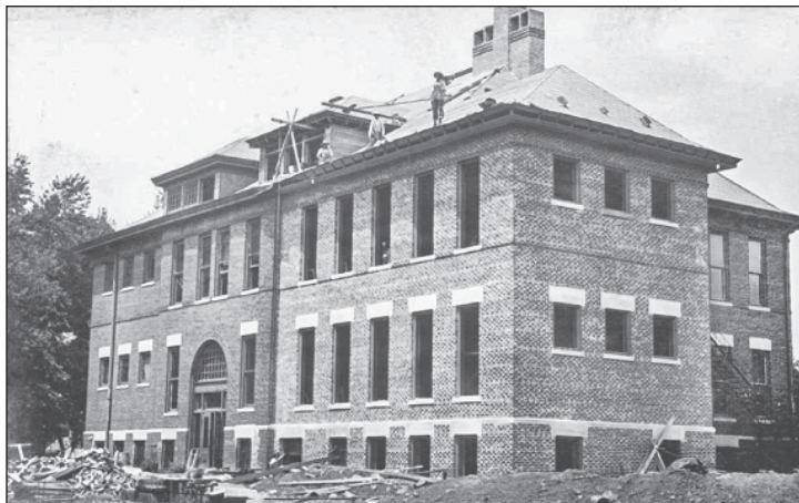
HIGH SCHOOL ROOMS addition to the original school building under construction in 1910.