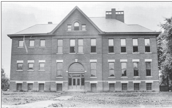
ARTHUR GRADE SCHOOL and High School building in 1902 in the 100 block of East Park Street.