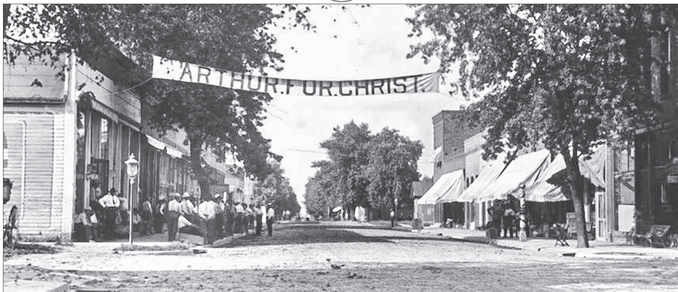
VINE STREET looking north from Illinois circa 1905. The banner advertises a church revival.