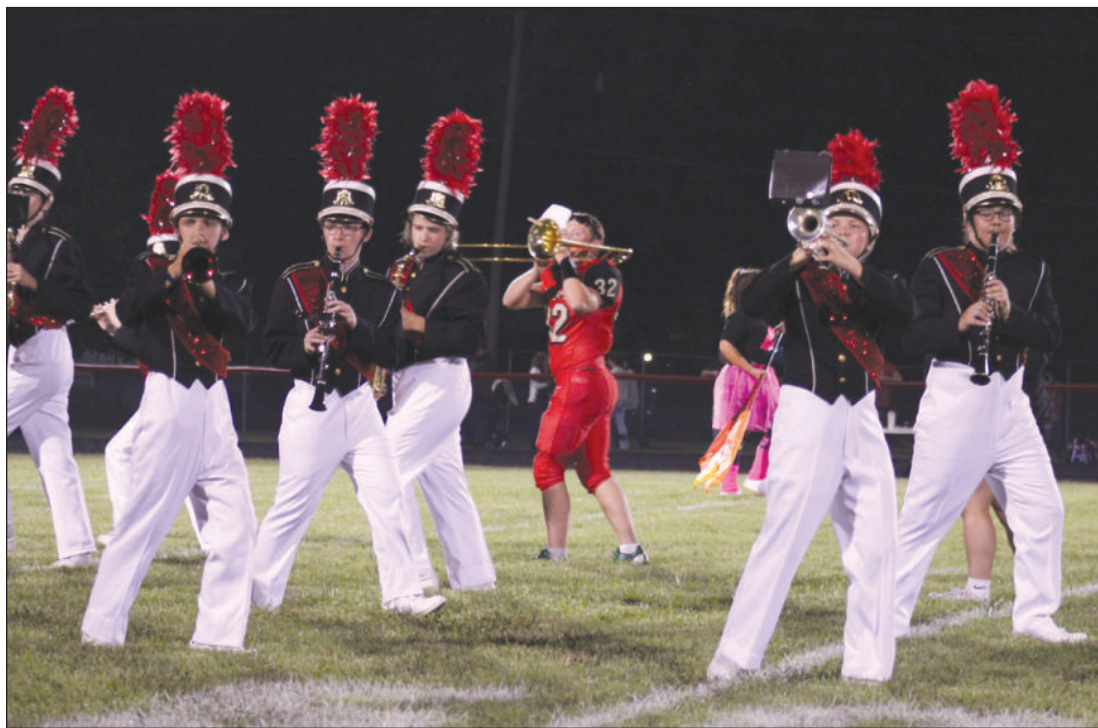
The ALAH Marching Knights performed two selections of the 2023 show at halftime of the football game on Friday, September 15. Ladies of the 80s is their show this year and they played "Hit Me With Your Best Shot" and "The Winner Takes All". The band will take part in the Marching Eagles Band Classic in Newton on October 7.

The parade will NOT go on the west side of Arthur Grade School (Park St. to Lincoln St.). We will have buses parked on the west side of Arthur Grade School on Vine St. between Park St. and Lincoln St.