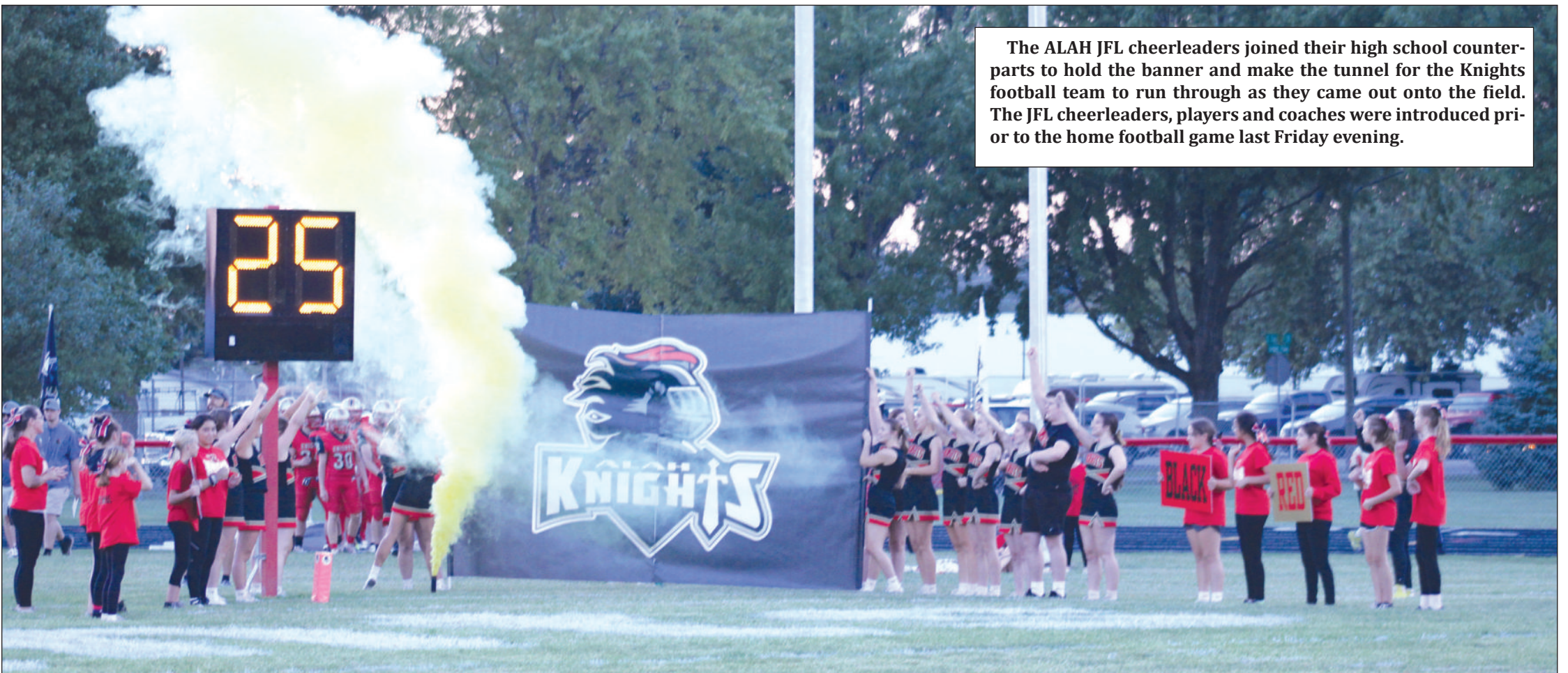
The ALAH JFL cheerleaders joined their high school counterparts to hold the banner and make the tunnel for the Knights football team to run through as they came out onto the field. The JFL cheerleaders, players and coaches were introduced prior to the home football game last Friday evening.