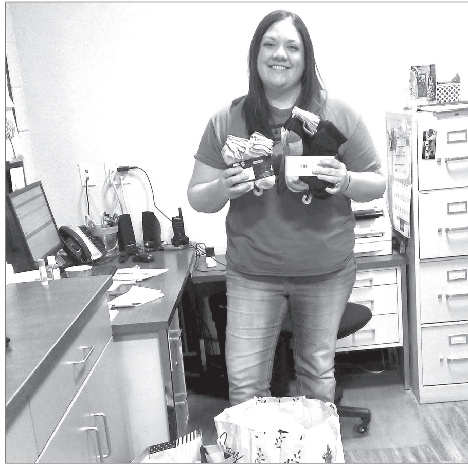
VILLA GROVE LIONS CLUB bought socks for students at Villa Grove schools.