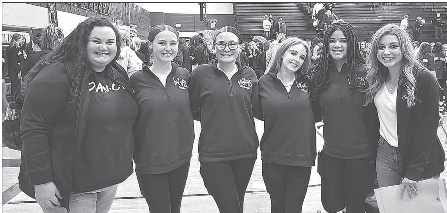
THE VILLA GROVE DEVILETTES received 2nd place in A Hip Hop, placed 12 out of 21 teams in the IHSA category 1A, and qualified for STATE at the Clinton competition on Jan. 14.