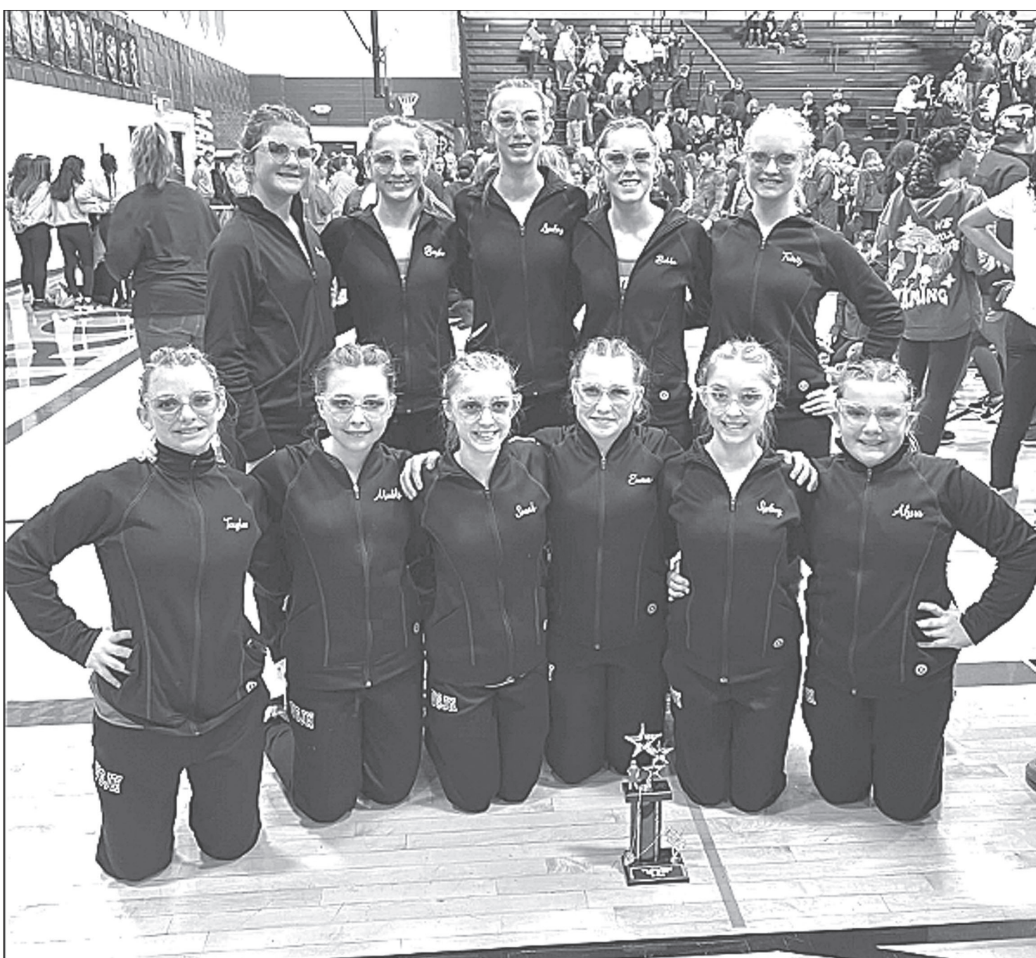
VILLA GROVE JUNIOR DEVILETTES got first place in JH Pom and fourth place in JH Hip Hop in their competition at Clinton Jan. 14.