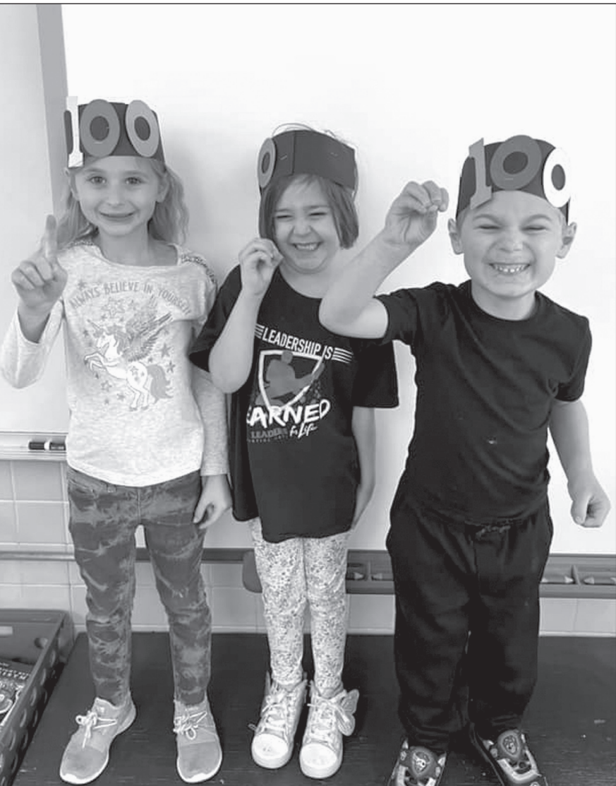
VILLA GROVE KINDERGARTEN celebrated 100 days of school. They made hats for the occasion. Submitted photos.