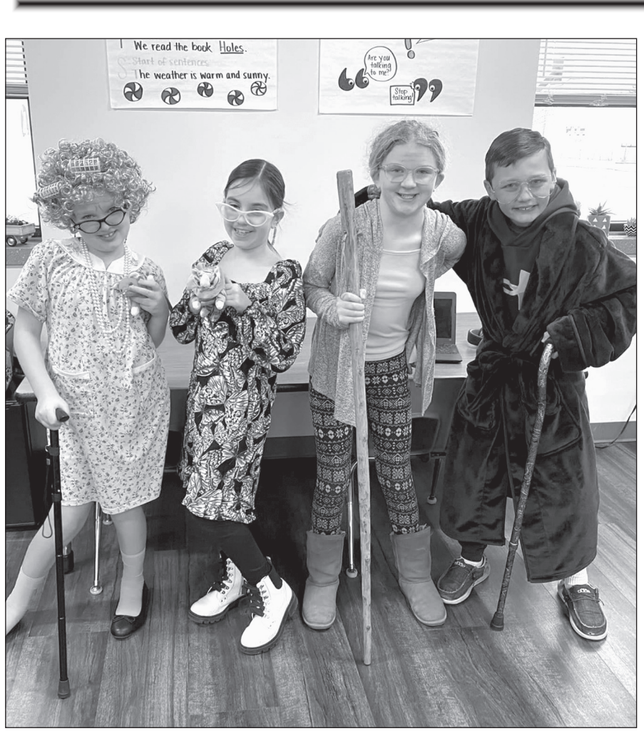
FOURTH GRADERS AT VILLA GROVE schools participated in the 100 days of school celebration. Submitted photo.