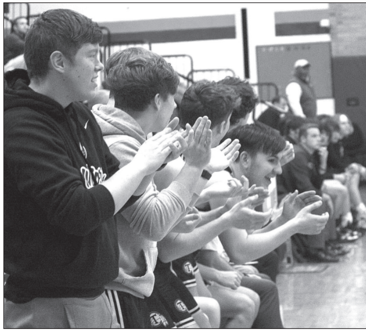
TUSCOLA WARRIORS CHEER on their team after making a comeback in the third quarter. The team trailed behind 21-20 in the first half.