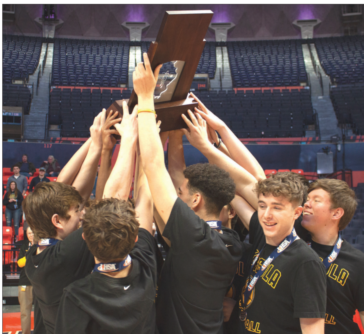
TUSCOLA WARRIORS BOY'S BASKETBALL TEAM holds up the third place trophy which they earned at the 2023 IHSA state championship.