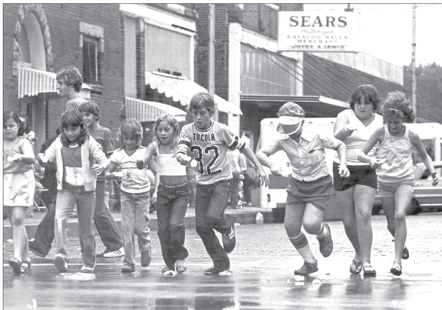
DO YOU RECOGNIZE this week's Back in the Day photo? If so, drop us a note at The Journal. Your efforts will be rewarded.