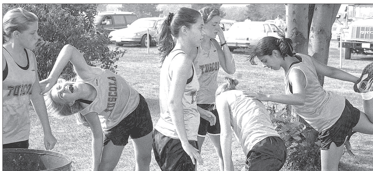
DO YOU RECOGNIZE this week's Back in the Day photo? If so, drop us a note at The Journal. Your efforts will be rewarded.