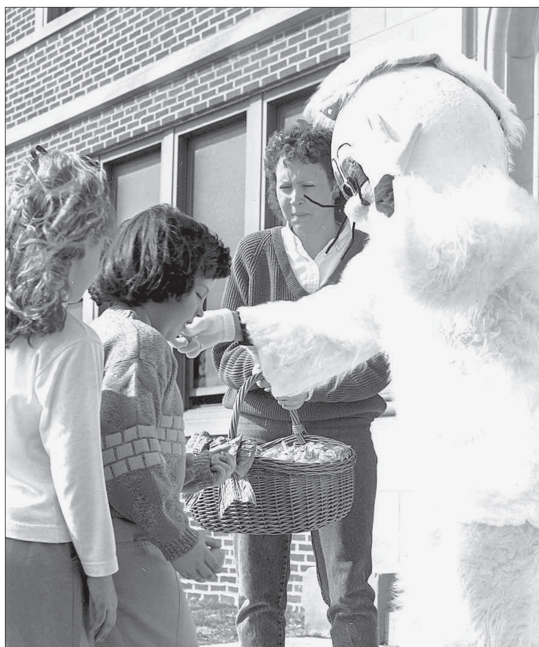
DO YOU RECOGNIZE this week's Back in the Day photo? If so, drop us a note at The Journal. Your efforts will be rewarded.