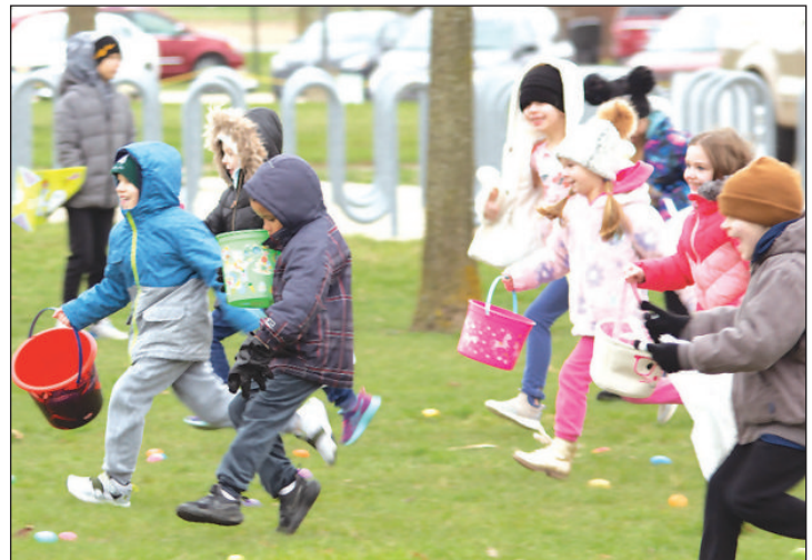
FIVE AND SIX-YEAR-OLDS run onto the field on April 1 during the Tuscola Easter Egg Hunt. After each hunt, kids went to the United Methodist Church foyer to exchange tickets for prizes.

(The views and opinions expressed in the submitted columns are those of the author and do not necessarily reflect the position of The Journal.)