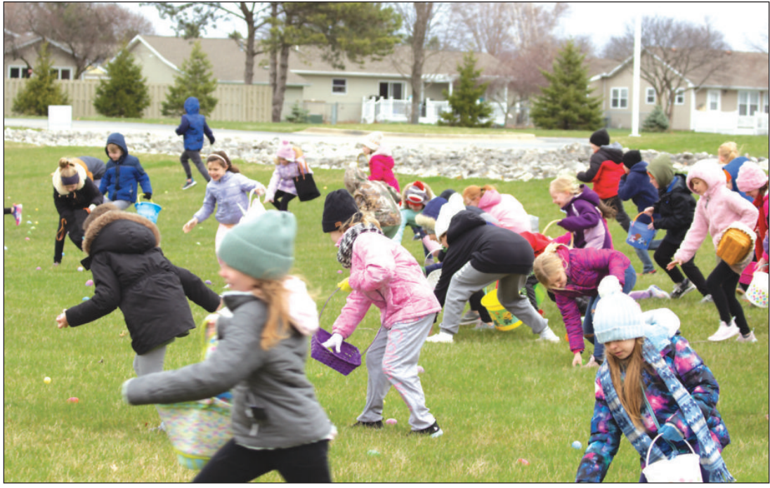
THE LAST GROUP of children take their turn combing through the soccer field next to North Ward for easter eggs.