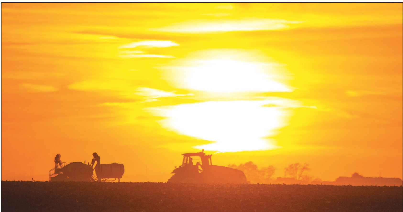
THE SUN SETS behind a farmer working the land in a field north-west of Tuscola.