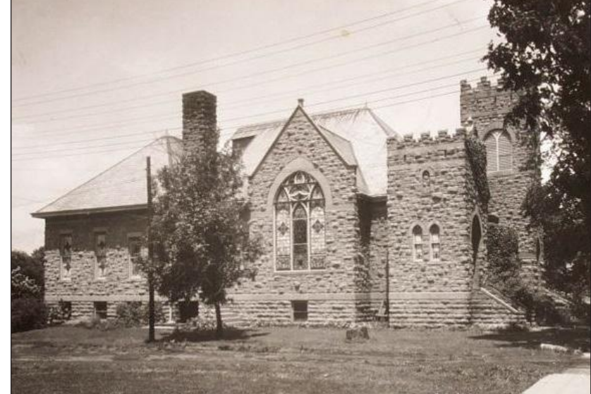
Tuscola Presbyterian Church in the 1940s