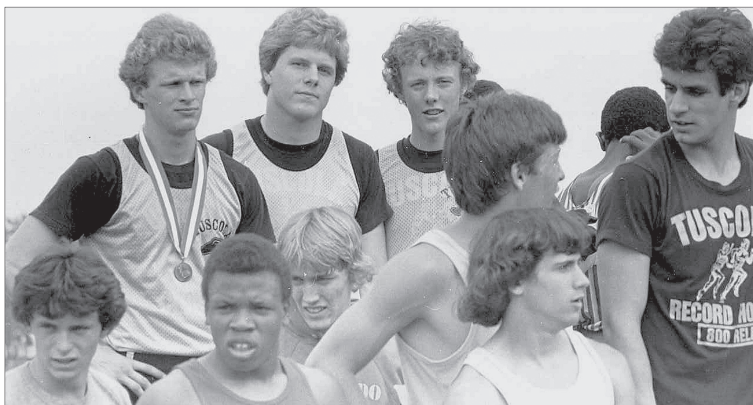
DO YOU RECOGNIZE this week's Back in the Day photo? If so, drop us a note at The Journal. Your efforts will be rewarded.