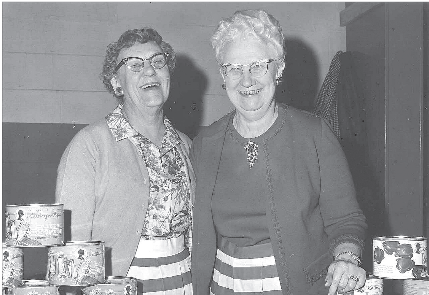
DO YOU RECOGNIZE this week's Back in the Day photo? If so, drop us a note at The Journal. Your efforts will be rewarded.