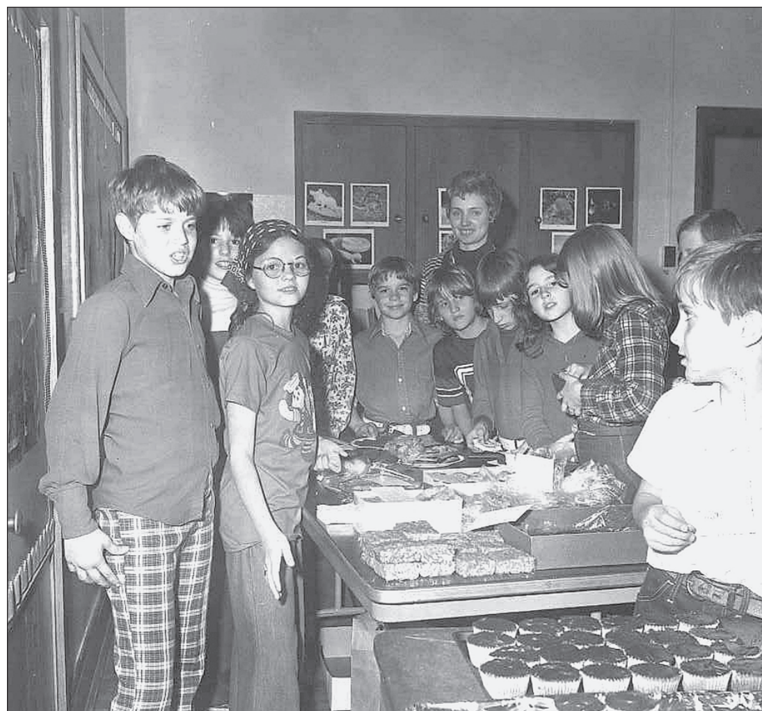
DO YOU RECOGNIZE this week's Back in the Day photo? If so, drop us a note at The Journal. Your efforts will be rewarded.

Celebrity waiters turned out in all manner of apparel for the 2003 Chamber of Commerce