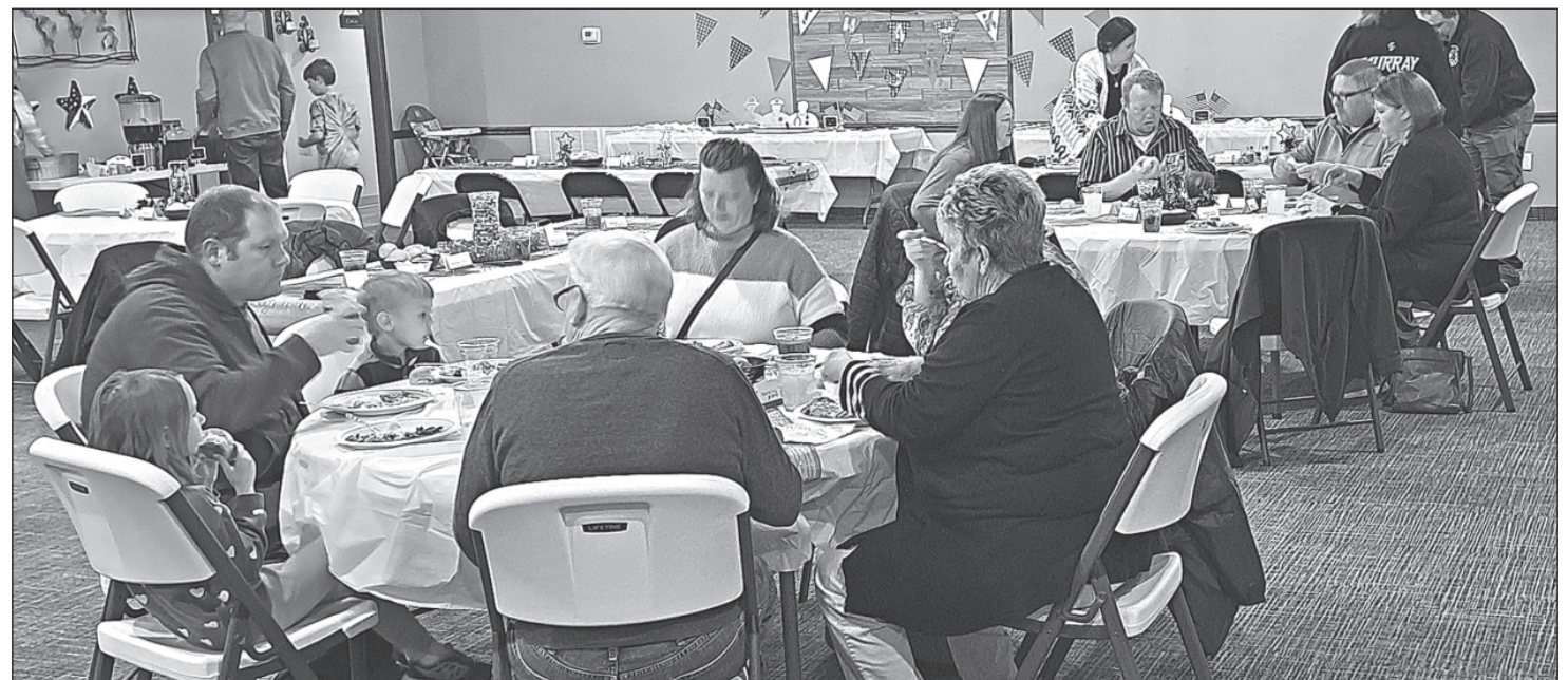
WOMEN from the Pentecostal Church made a dinner for all first responders and city officials on April 30.