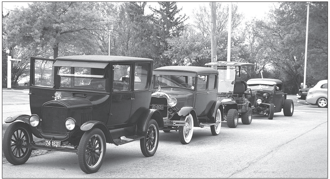
A VARIETY OF CLASSIC, muscle, sports, antique and other tuned up cars lined the parking lot of Ta'Carbon during the May 6 Third annual motor vehicle show.