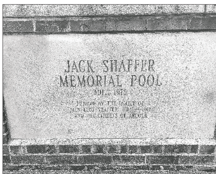
A PLAQUE that once marked a wall at the entrance to the Jack Shaffer Memorial Pool at Moore Park, the wall included a plaque with a quote by Eisenhower and within the wall was embedded a capsule containing Jack Shaffer's military medals.