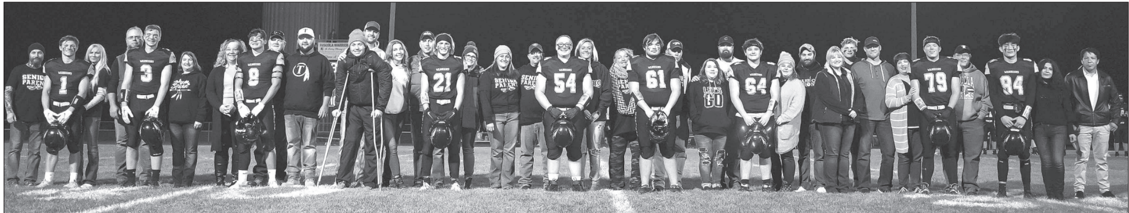
TUSCOLA HIGH SCHOOL SENIOR FOOTBALL players lined up with their parents on Oct. 14 to celebrate senior night.