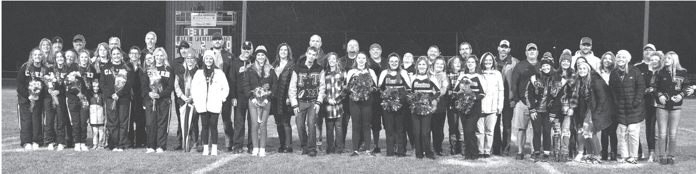
TUSCOLA HIGH SCHOOL SENIORS were celebrated on Oct. 14 during Football Senior Night. Tuscola seniors from cheer, cross country, dance and golf teams line up with their parents on the field.