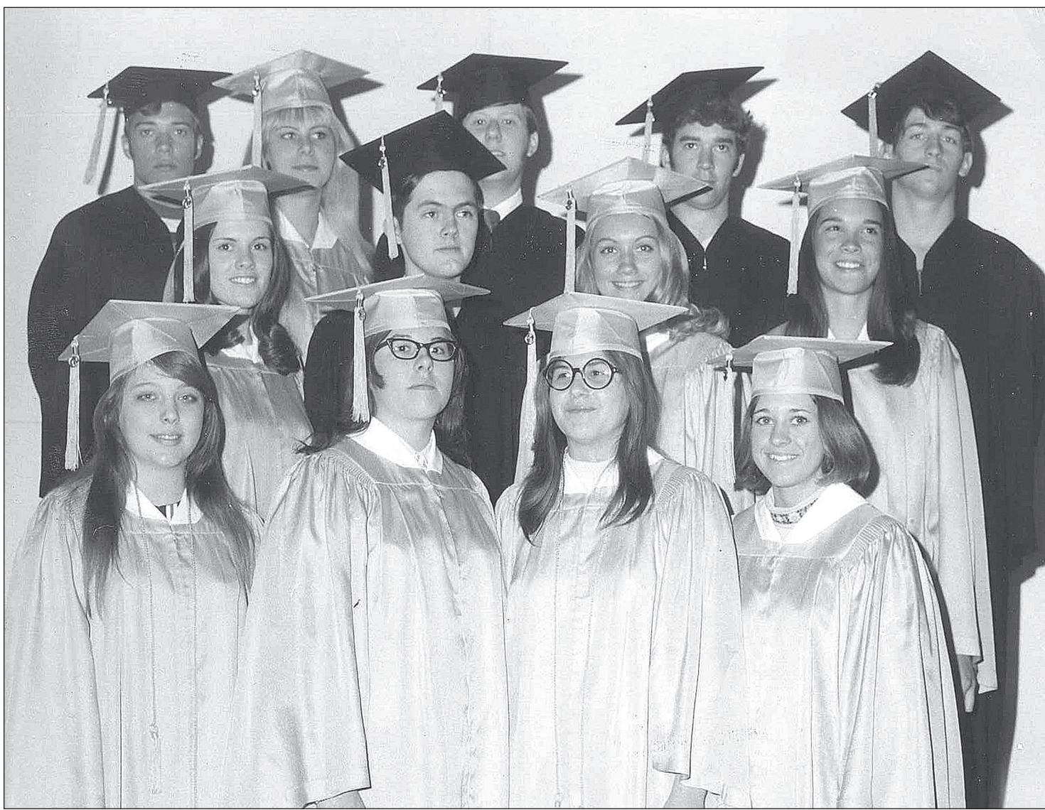
DO YOU RECOGNIZE this week's Back in the Day photo? If so, drop us a note at The Journal. Your efforts will be rewarded.