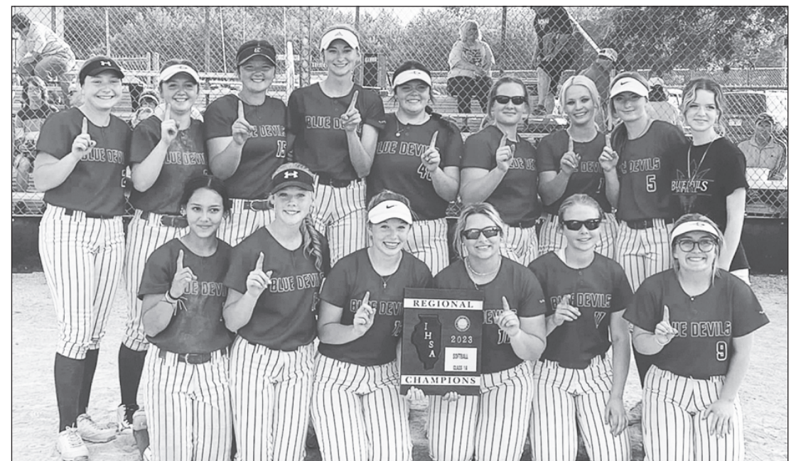
VILLA GROVE SOFTBALL won the IHSA Class 1A regional 2023 championship on May 18.