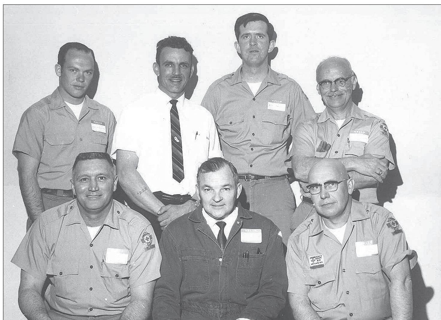
DO YOU RECOGNIZE this week's Back in the Day photo? If so, drop us a note at The Journal. Your efforts will be rewarded.

Stifel, Nicolaus & Company, Incorporated | Member SIPC & NYSE | www.stifel.com