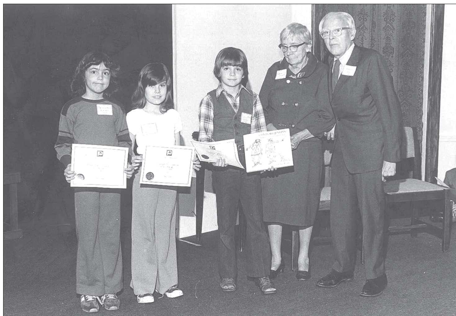
DO YOU RECOGNIZE this week's Back in the Day photo? If so, drop us a note at The Journal. Your efforts will be rewarded.