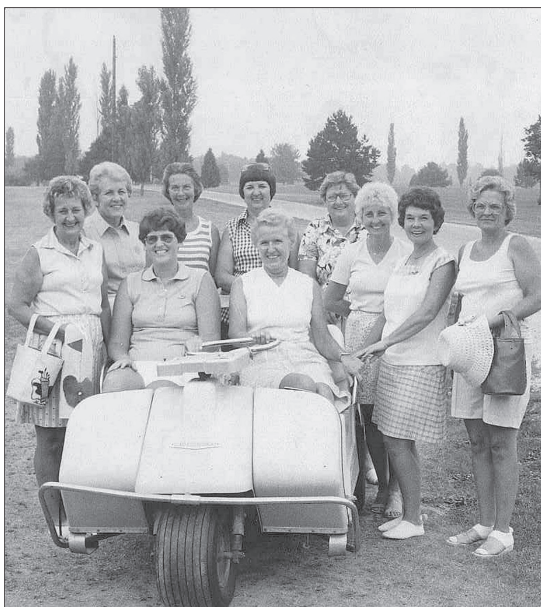
DO YOU RECOGNIZE this week's Back in the Day photo? If so, drop us a note at The Journal. Your efforts will be rewarded.

An amendment to Tuscola's original redevelopment agreement with Cohen Development Co. helped secure financing for the $20 million factory outlet mall project. Tuscola City Council unanimously approved the amendment, giving Cohen the go-ahead